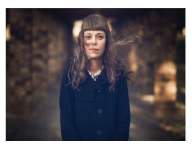
Composer: Holly Harrison

The word 'slipstream' refers to the current of air behind a rapidly moving vehicle. In motorsports, this reduced air pressure and forward suction allows vehicles to follow closely behind another, with the least resistance, before overtaking. The work is cast in five short movements, each streaming on from the next. In this way, Slipstream is imagined as different types of musical motion and momentum – duos and trios within the sextet are pulled along by opposing subsets before making their own move and overtaking. The most obvious example of this is the contrast between straight and swung rhythms and faster and slower tempos: each can be heard as an attempt to push or pull against the current, before slipping into a new direction. The overall effect is quite playful, with plenty of deception and subterfuge at work.